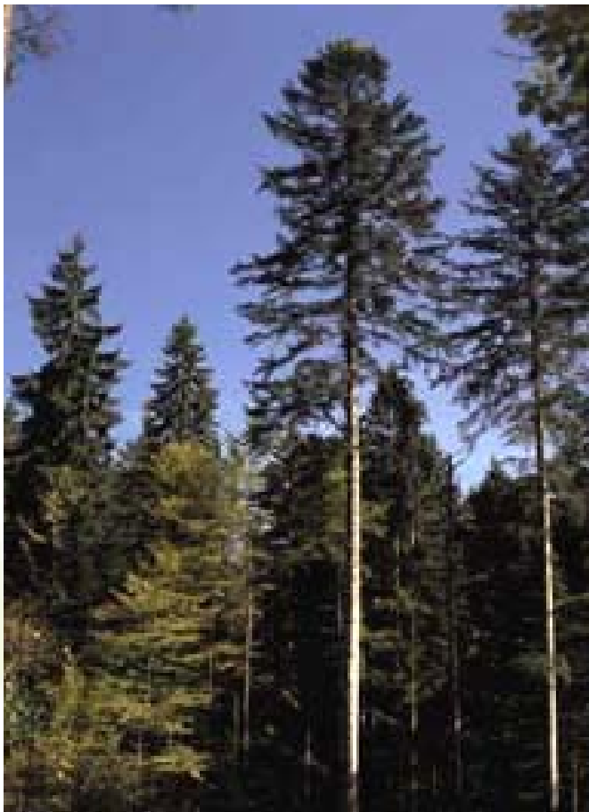
proven by Nature