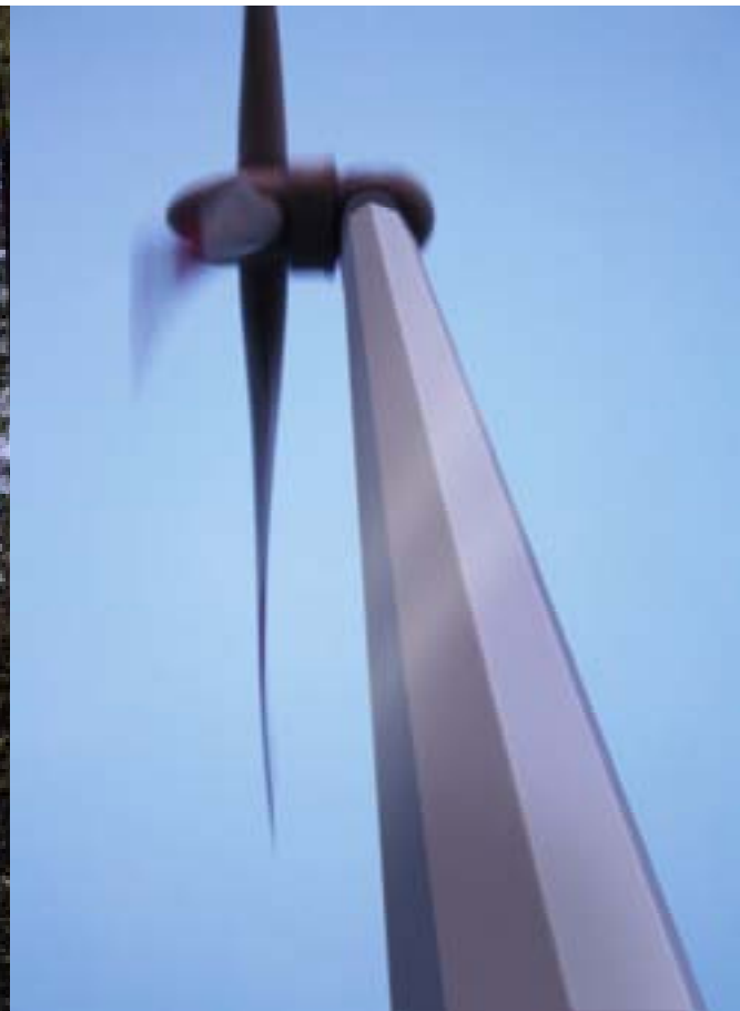
strong by design